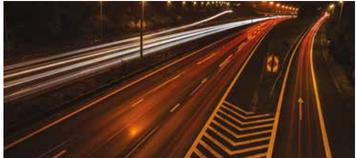
E17 Motorway (Belgium)