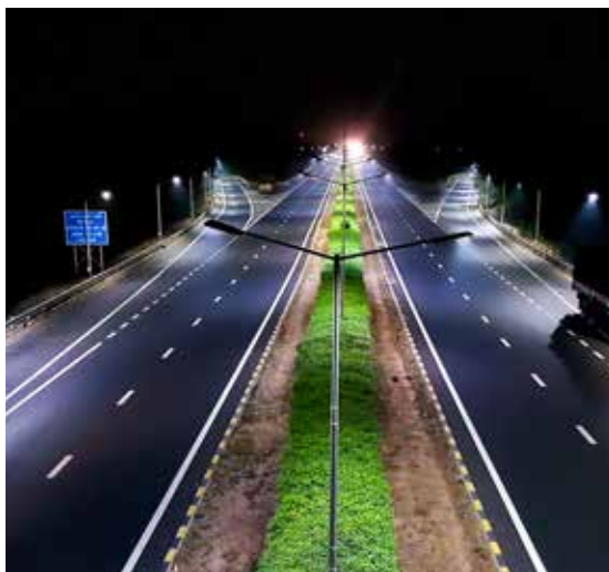
Ahmedabad-Vadodara Expressway (India)