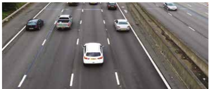
M25 Motorway (United Kingdom)