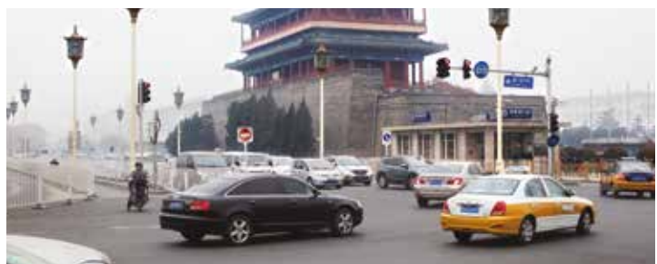
Chang'an Avenue (China)