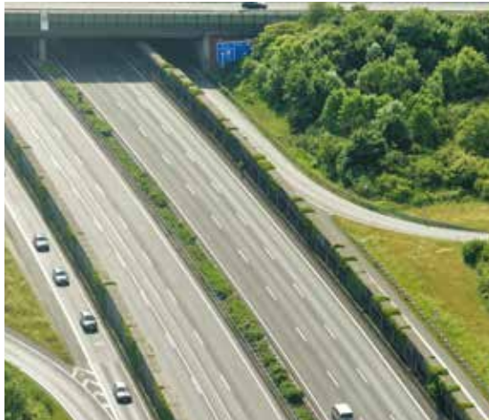
A2 Motorway (Germany)

Our products are the solution of choice for iconic structures globally. Here are some of the most iconic infrastructures with Shell Cariphalte as the main bitumen solution: